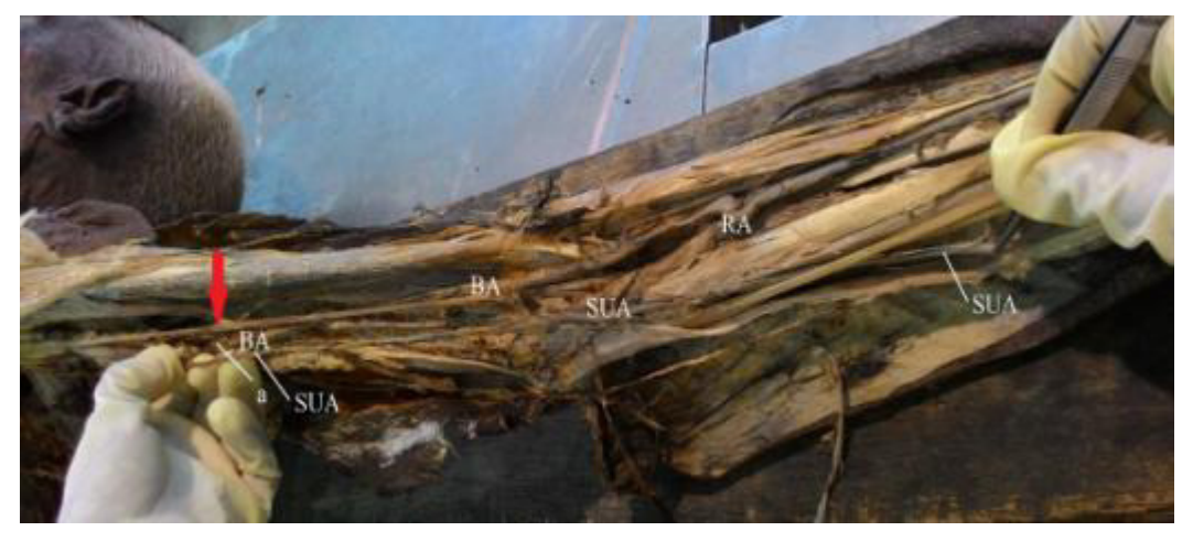
Figure 1: Origin & course of Superficial Ulnar Artery [BA- Brachial Artery, SUA – Superficial Ulnar Artery, RA – Radial Artery, a – Origin of SUA]

In the middle third of the left arm, the BA was seen to give rise to a branch medially. This branch had a superficial course throughout its entire extent. It passed superficial to the muscles attached to the medial epicondyle of the humerus as well as the bicipital aponeurosis before entering the forearm and passing along its medial side. It was then seen to enter the palm, superficial to the flexor retinaculum, whereby it continued to form the SPA. This branch of the BA was hence identified as the superficial ulnar artery (SUA).