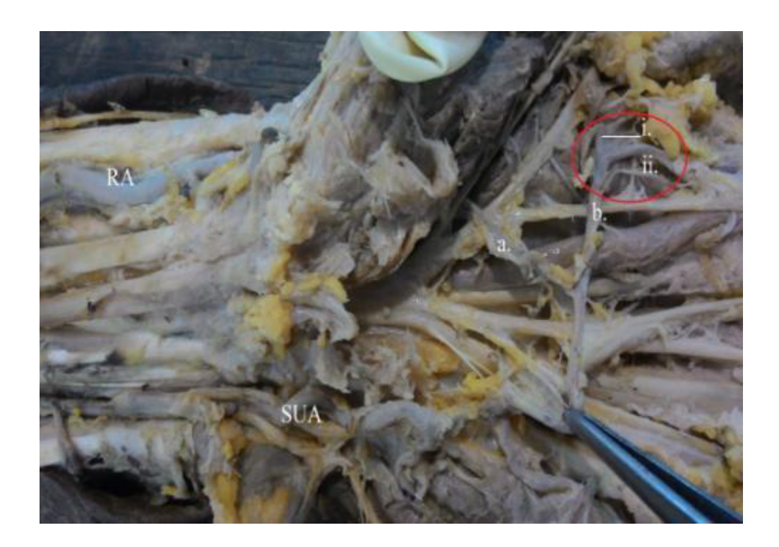
Figure 3: Anomalous branching of SPA

[RA – Radial Artery, SUA – Superficial Ulnar Artery, a – superficial terminal branch of RA, b – most lateral common palmar digital artery, i – arteria princeps pollicis, ii – arteria radialisindicis]